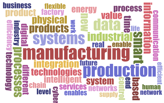
Fig. 3. Tag cloud of 50 most often used words within category organization.

480 text fragments were associated with the category organization, most of them addressing the process (65%) and/or the enterprise (65%) system level. The most relevant key features exclusively relevant for this category are described in detail in the following subsection. Additionally, Fig. 3 shows a tag cloud of the 50 most often used words (excluding stop words) within the text fragments of the category organization.